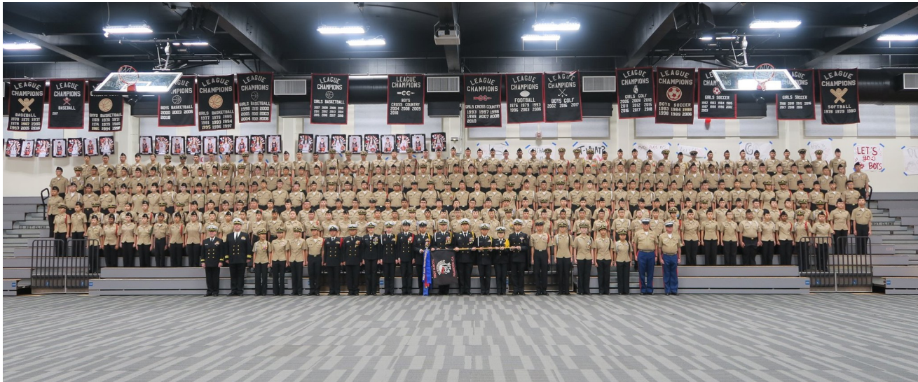
picture from last year's Annual Military Inspection