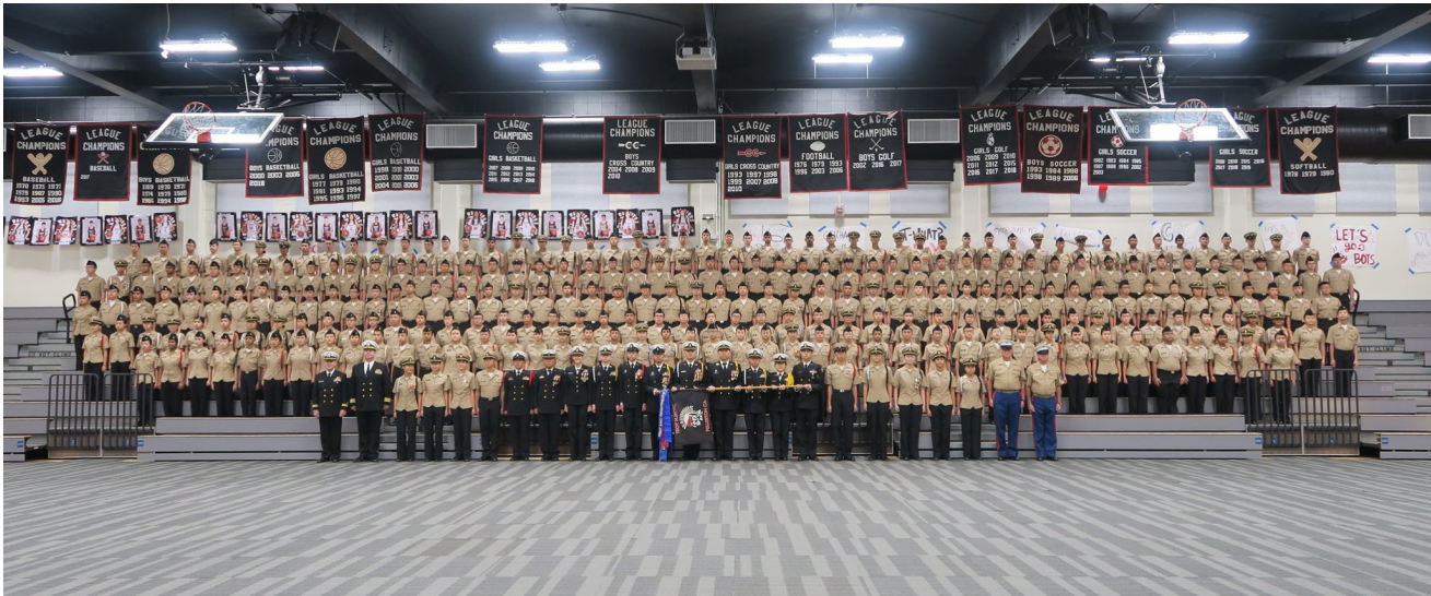
Picture from the 2020 Annual Military Inspection