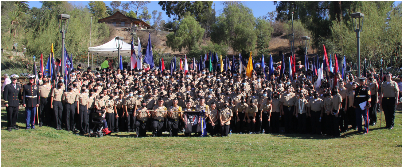
Picture from 2021 Veteran's Day parade